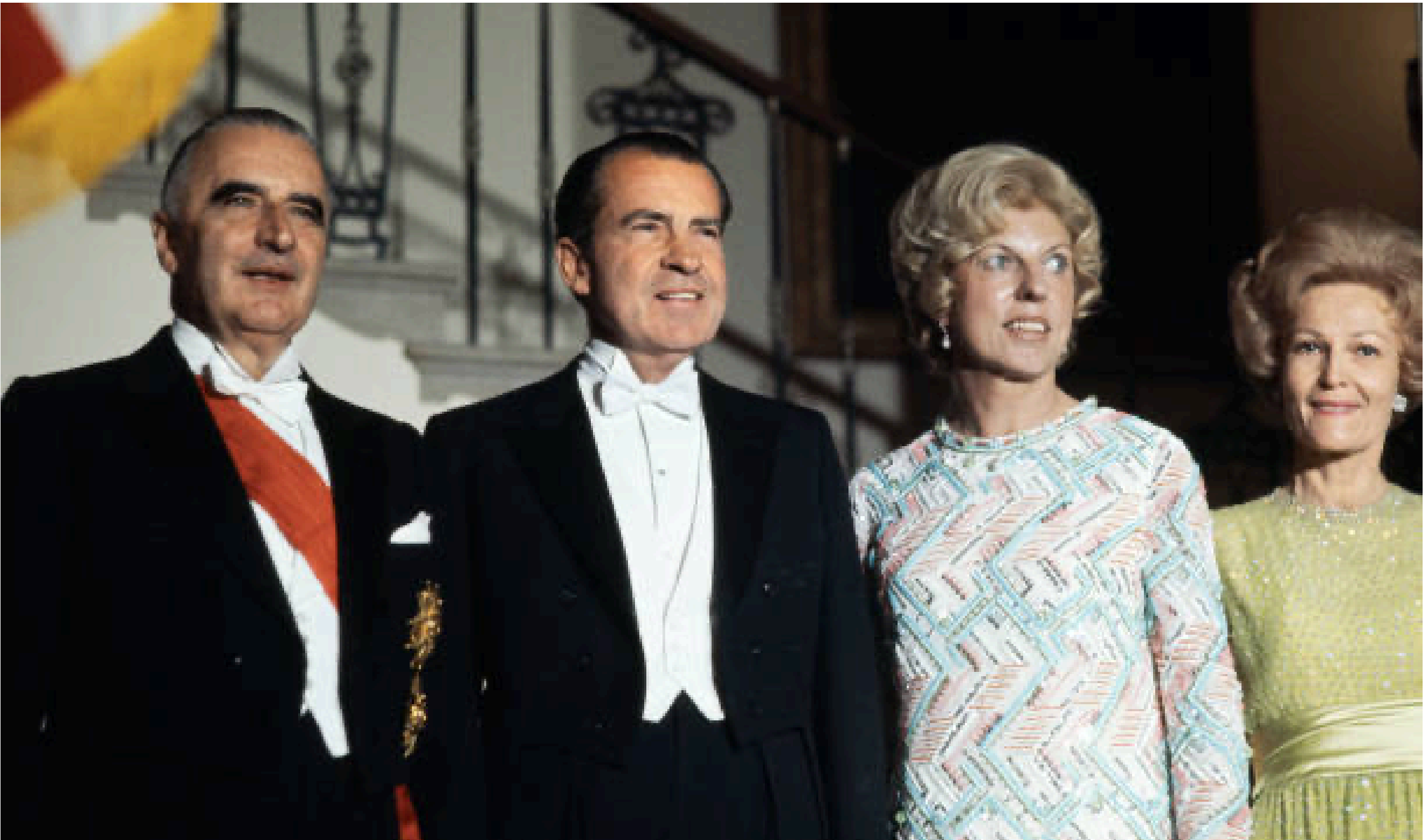
From left to right, President of France Georges Pompidou (1911-1974), President of the United States, Richard Nixon (1913-1994), Claude Pompidou (1912-2007) and Pat Nixon (1912-1993) pictured together during a State Visit by the French President to the White House and Washington DC on 27th February 1970.

The Georges Pompidou Institute, chaired by former Prime Minister Alain Juppé, is dedicated to preserving and promoting the legacy and ideas of Georges Pompidou. Founded in 1989 as an association of the former President’s close collaborators — at the initiative of former Prime Ministers Pierre Messmer and Édouard Balladur — and officially recognized as a public-interest organization in 1993, the Institute works with the support of the Prime Minister’s Office and in close collaboration with the academic community. Its mission is carried out through conferences, publications, and a comprehensive oral history program that includes 180 interviews totaling 800 hours of recorded testimony. Its commemorative mission has long shaped its activities — most notably the 50th anniversary of President Pompidou’s passing in 2024, held under the high patronage of the President of the French Republic. Today, the Institute has a dual purpose: to support academic research and to share Pompidou’s vision and achievements — in politics, economics, industry, culture, and more — with a broad audience in France and abroad, including students, citizens, policymakers, and thought leaders, to inform public debate and inspire responses to contemporary challenges. The Georges Pompidou Institute is currently transitioning into a public-interest foundation, opening new avenues for private sponsorship and philanthropic support.